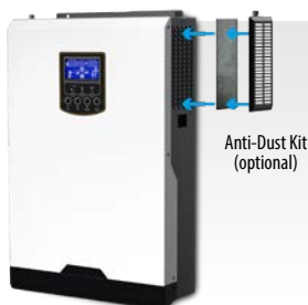
Anti-Dust Kit (optional)